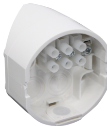
Inside corner socket RC-plus next Art.No: 97005

Dimensions: Ø 164 x 143 mm Impact strength: IK09 Housing: coated steel basket