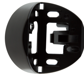
Outside corner socket RC-plus next Art.No: 97024

Dimensions: 60 x 61 x 68 mm Degree / class of protection: IP54 Housing: Housing UV- and shockresistant