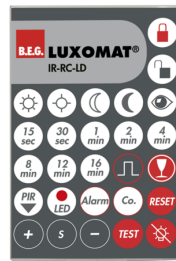
IR-RC-LD Art.No: 92649

Battery: 3.0 V Lithium CR2032 (inclusive) Dimensions: 80 x 60 x 8 mm Material color: -